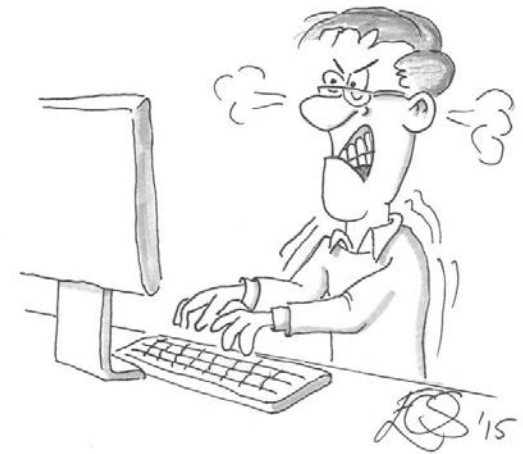
How not to respond to reviewers' comments.