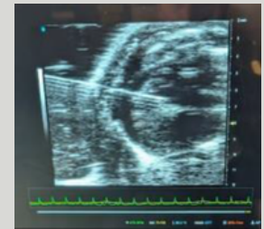
Liver tumor volumetrics (top) and image-guided cardiac injection (bottom)