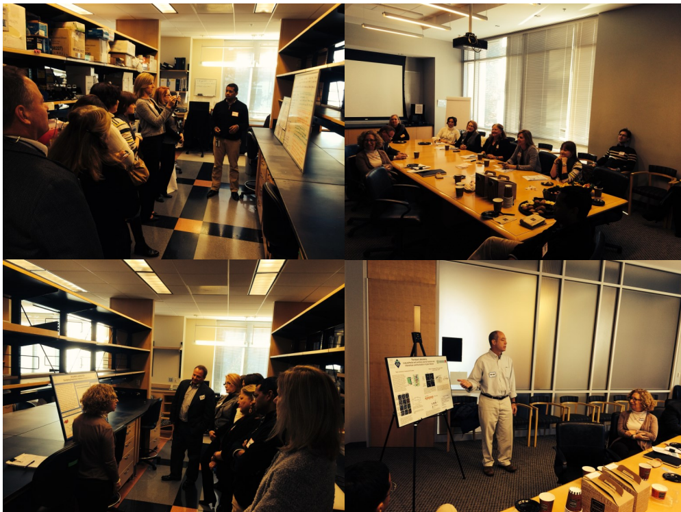
Lab tours and chatting around breakfast

All in all, the day was a success. A reminder to the researchers that their tiresome work is for people in their community. And hope to the ShamRockin' Army members that their fundraising supports passionate and smart scientists working for them every day.