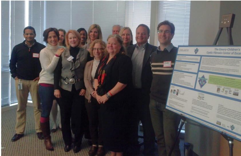
ShamRockin' Army members and CF-AIR Researchers

In November 2014 members from the ShamRockin' Army visited several of the labs at the Emory-Children's Center. This was a chance for family, friends and supporters of CF patients to see the CF-AIR researchers in action and for the CF-AIR researchers to share their work. The visit turned into a chance for the visitors to learn more about the process of